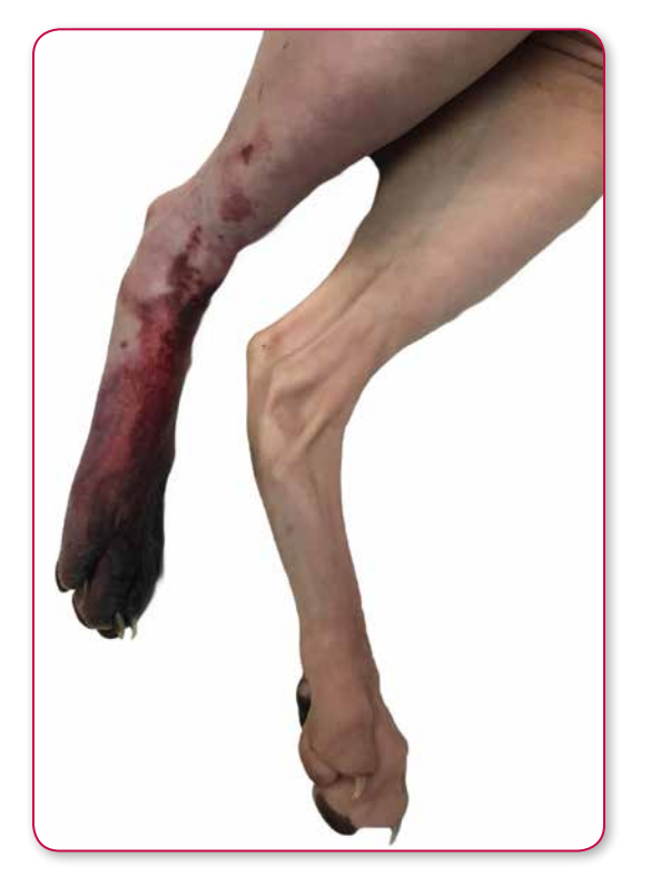
Figure 1 – Rear limbs from a Sphynx cat affected several days previously by ATE. The right rear limb is devitalized distally, with catastrophic loss of perfusion and development of gangrenous necrosis.

anti-platelet effects in this species, and is dosed at 18.75 mg per cat orally once daily (1/4 of a 75mg tablet). In the only blinded, prospective study evaluating thromboprophylaxis in clinical cats that had suffered a prior ATE event, clopidogrel was superior to aspirin with a difference in median survival time of 251 days in favor of clopidogrel.<sup>6</sup> As generic forms of clopidogrel are now available, there is less of a cost difference compared to aspirin. However, aspirin can still be prescribed for thromboprophylaxis if clopidogrel is not feasible; the typical aspirin dose is 1/4 of an 81 mg tablet per cat every 72hrs. Typically, the CEG members advise clients to choose 2 days per week to give the aspirin (e.g., Wednesday and Sunday) to improve compliance. An alternative dosing strategy for aspirin is 1-2 mg/kg every 24 hours. For those clients with severe cost concerns, aspirin is given as sole therapy. Some cardiologists choose sole therapy for those cats with moderate left atrial enlargement and advise dual-therapy using both aspirin and clopidogrel for cats with severe left atrial enlargement, prior ATE, or spontaneous echogenic contrast. Side effects of either drug appear to be primarily gastrointestinal, with roughly 10-15% of cats on aspirin developing inappetence, vomiting, diarrhea, melena, or hematochezia. If this develops, the aspirin should be discontinued and sole-therapy with clopidogrel continued.